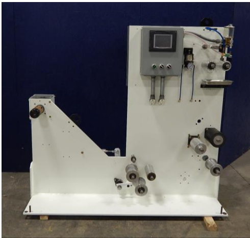
Medium Speed Setup

Ronco Machine, Inc. now offering their new Standalone Unwind Stand with Glue extrusion system. With this offering, your existing core winders (of any brand) can be upgraded from their old messy glue pot system to a new clean, money saving extrusion system. Our new standalone unwind stand with glue extrusion system can be used for both 1 and 2 ply cores. This integrated unit allows for easy web alignment from reel to winding mandrel. This setup operates independently from the existing core winder controls (no electrical tie-in required).